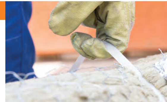
Carrying band – easier, safer handling

Our wired mats are, pursuant to the requirements of AGI worksheet Q132, quality controlled according to VDI 2055.