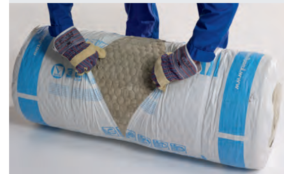
Tidy – Unwrap and carry