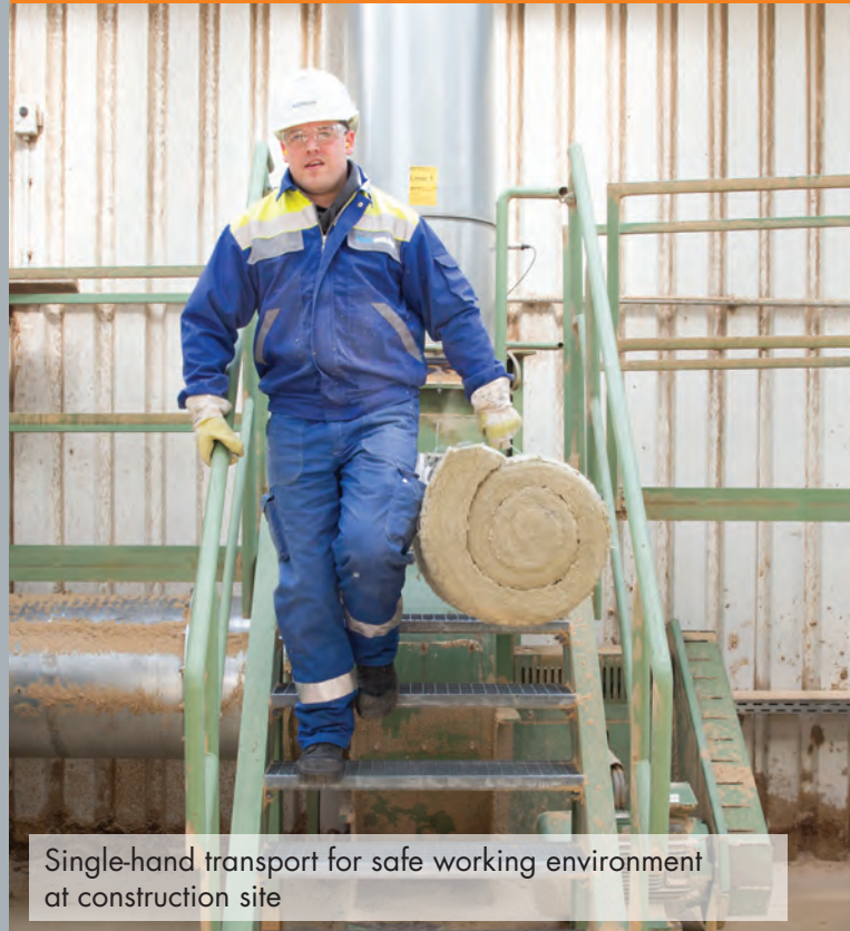
Single-hand transport for safe working environment at construction site

Knauf Insulation has invested heavily to further improve the product quality of its Wired Mat making it easier and safer to handle.